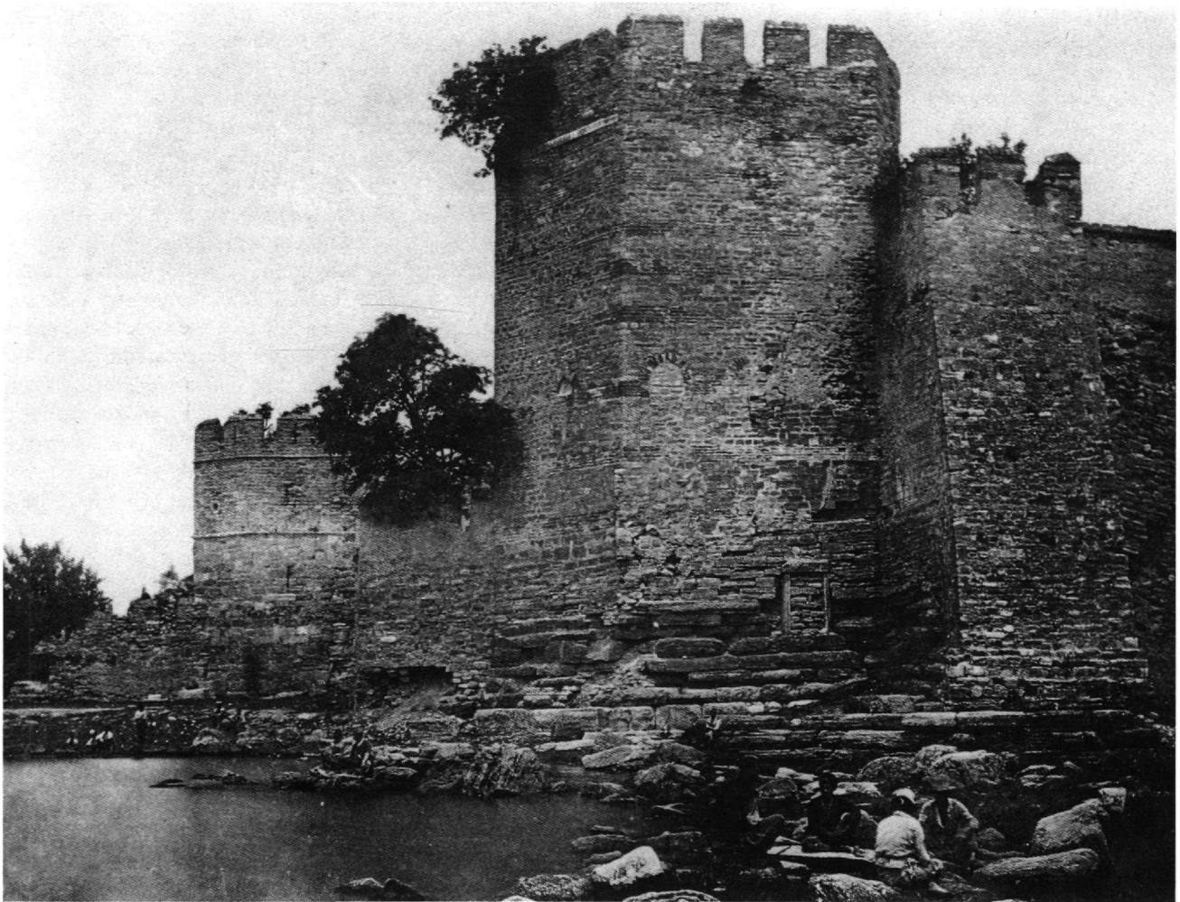
Fig. 2. Inner land-wall of Constantinople, view of tower number 1 from the southwest, taken circa 1870. (After: Meyer-Plath - Schneider, op.cit. , pl. 25).

Horn) 7 . But the description is less apt for these towers, for they are, in fact, some seventy-five meters inland, while tower number 1 stands right at the water's edge. Furthermore, the poet stresses that his tower is one that "stands alone" (lines 29-30), and this characterization does not describe the hexagonal towers of the Blachernai well, since they are set in a clump together with other towers.