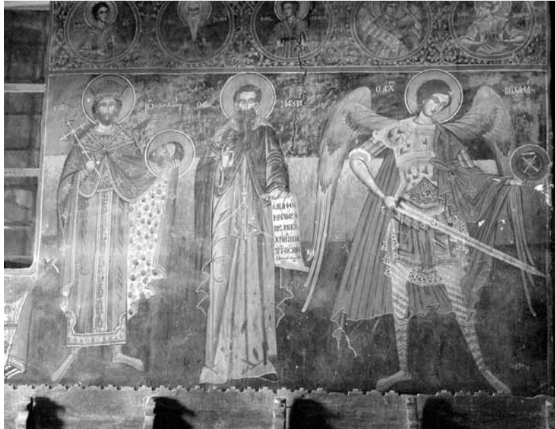
12. St. John Vladimir, St. Nahum and Archangels Michael. The church of Archangels Michael and Gabriel (1682-1728), Vithkuqi.