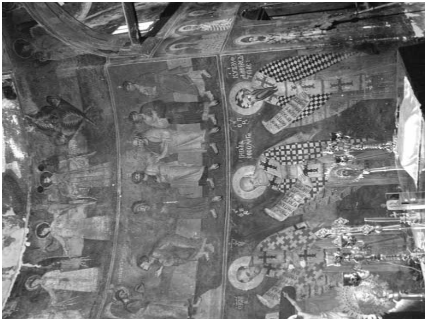
3. The Apse. The church of St. Nicholas (1726), Moschopolis.