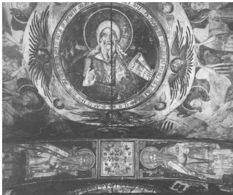
8. The God Sabbaoth. The church of St. Athanasios (1745), Moschopolis.