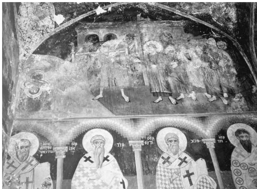
15. Saints and the Healing of the Paralytic. The church of St. Nicholas (1726), Moschopolis.