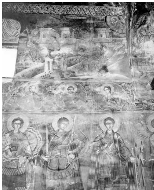
13. Saints. The church of Archangels Michael and Gabriel (1720-1725), Moschopolis.