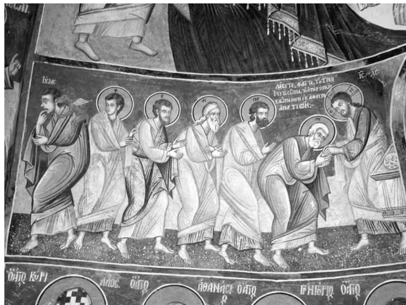
6. The Communion of Apostles. The church of SS. Peter and Paul (1764), Vithkuqi.