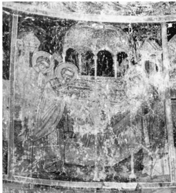
2. The Liturgy of St. John Chrysostom. The church of Archangels Michael and Gabriel (1720 - 1725), Moschopolis.