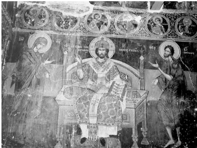
11. King's Deesis. The church of Archangels Michael and Gabriel (1682-1728), Vithkuqi.