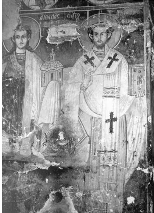
16. St. Aitalas and St. Gregory Dialogos. The church of SS. Peter and Paul (1764).