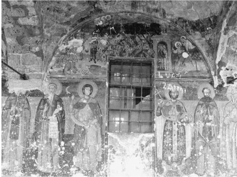
18. Saints and Apocalypses. The church of St. Nicholas (1750), Moschopolis.