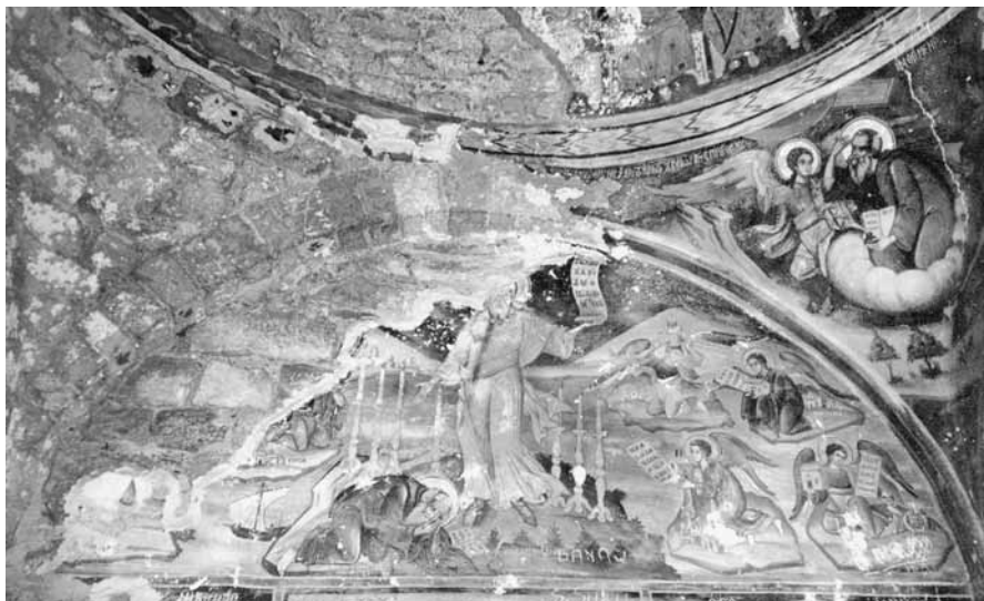
17. Apocalypses (1:12-18). The church of St. Nicholas (1750), Moschopolis.