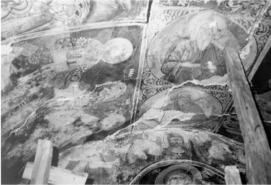
5. The Three-Faced Christ and The Crowning of the Holy Virgin. The chapel of SS. Cosmas and Damian (1750), Vithkuqi.