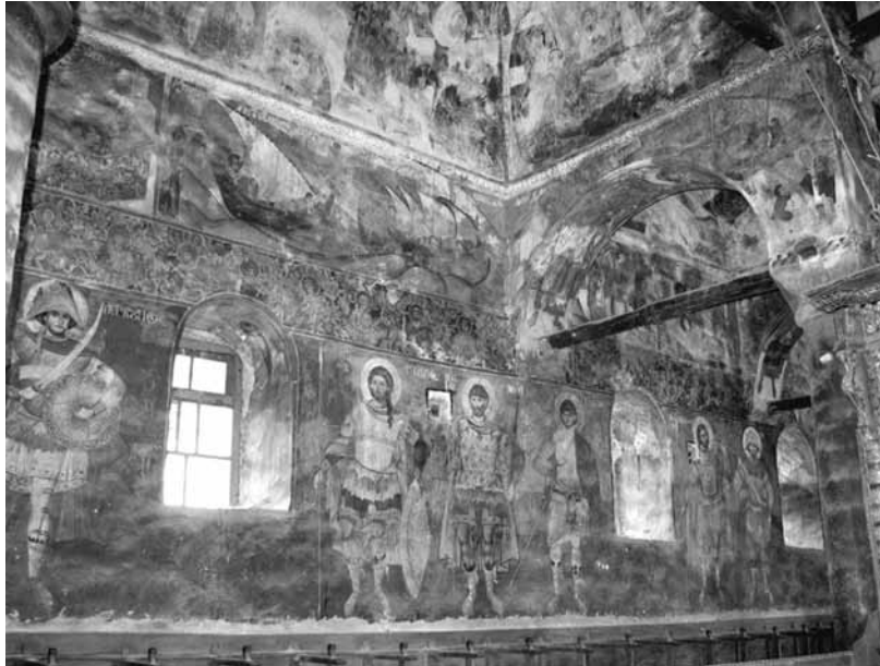
14. Saints and Scenes from St. Nicholas Vita. The church of St. Nicholas (1726), Moschopolis.