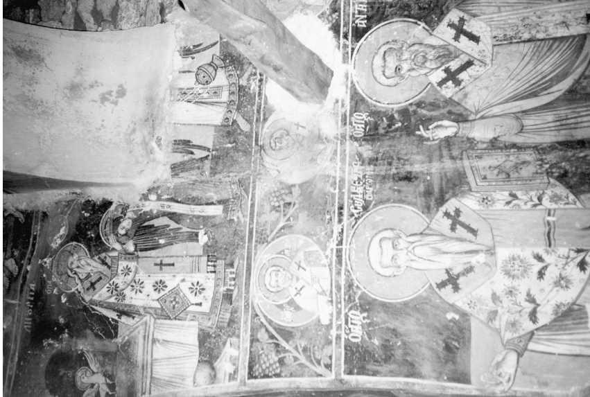
4. The Divine Liturgy. The church of St. George (1767), Vithkuqi.