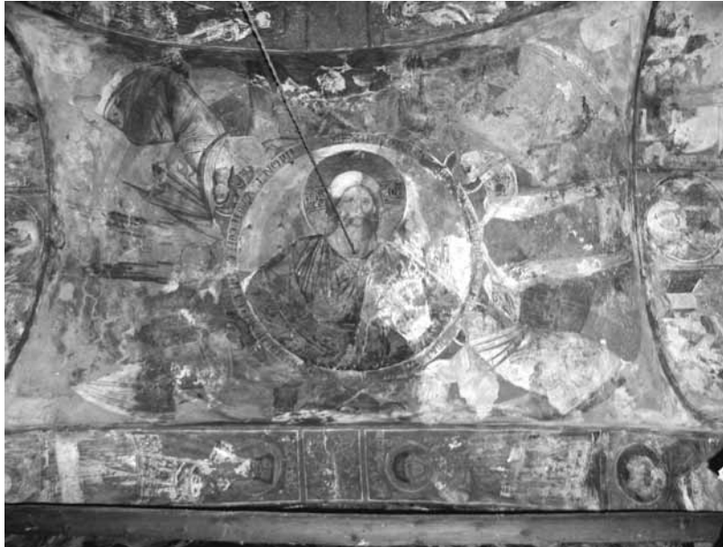
7. The God Sabbaoth. The church of St. Nicholas (1726), Moschopolis.