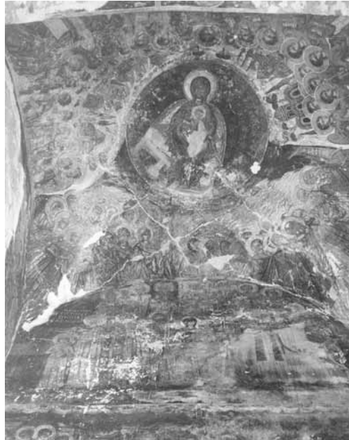
10. In Thee Rejoiceth and The Orthodox Sunday. The church of Dormition of Holy Virgin (1712), Moschopolis.