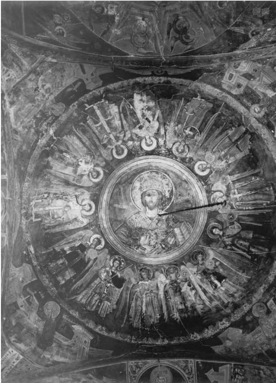
9. Christ King of Kings and High Priest. The church of Archangels Michael and Gabriel (1720-1725), Moschopolis.