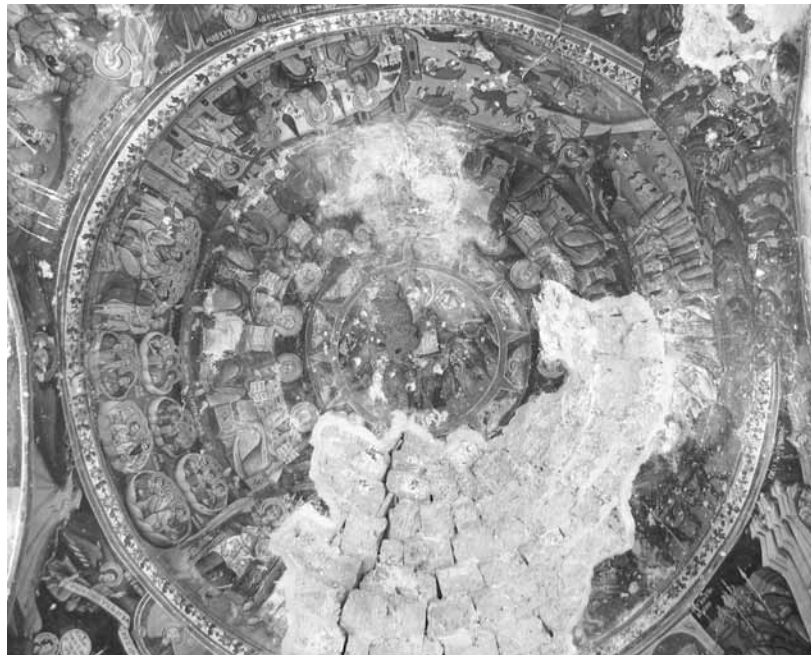
19. The Last Judgement. The church of SS. Peter and Paul (1764).